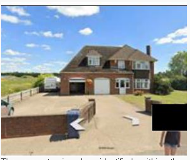
The property is also identified within the Applicant's visual assessment with Major Significant Adverse Effects: